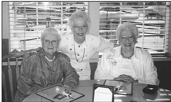
Alums from the early classes of Marycrest

The Earth Charter is a declaration of fundamental principles for building a just, sustainable and peaceful global society in the 21st Century. Through music, arts, speakers, workshops, and panel and discussion groups, the summit will bring people together to identify creative and realistic actions to implement Earth Charter principles in their families, work places, faith communities and organizations. Visit www.quadcityearthchartersummit.org for more information.